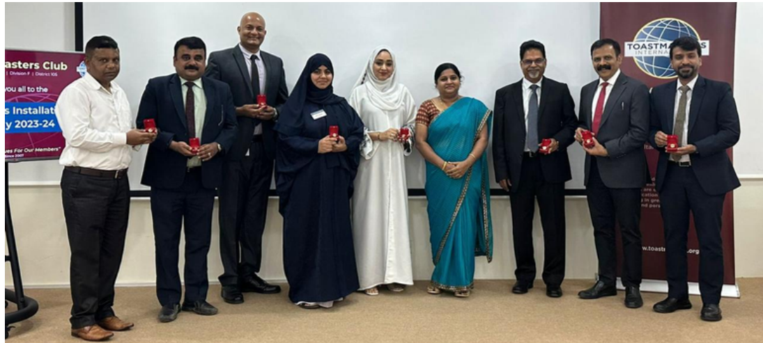
Club Officers Installation