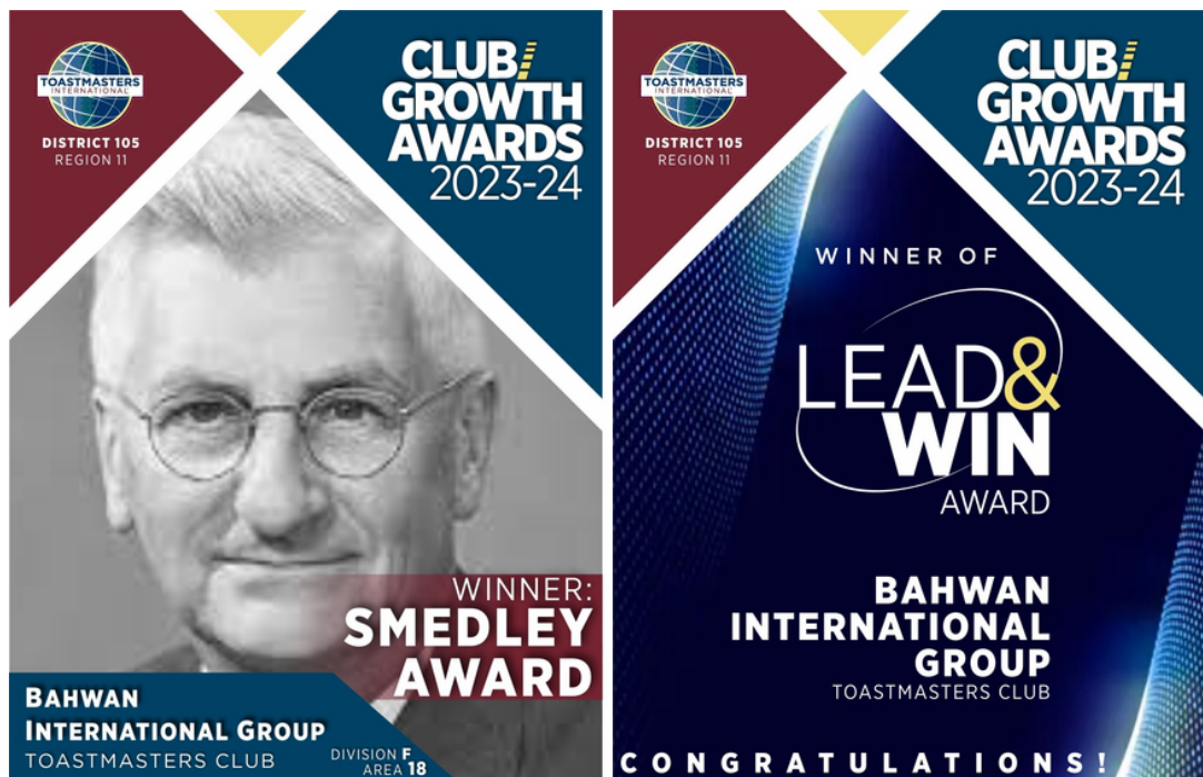
Awards & Recognition from District 105