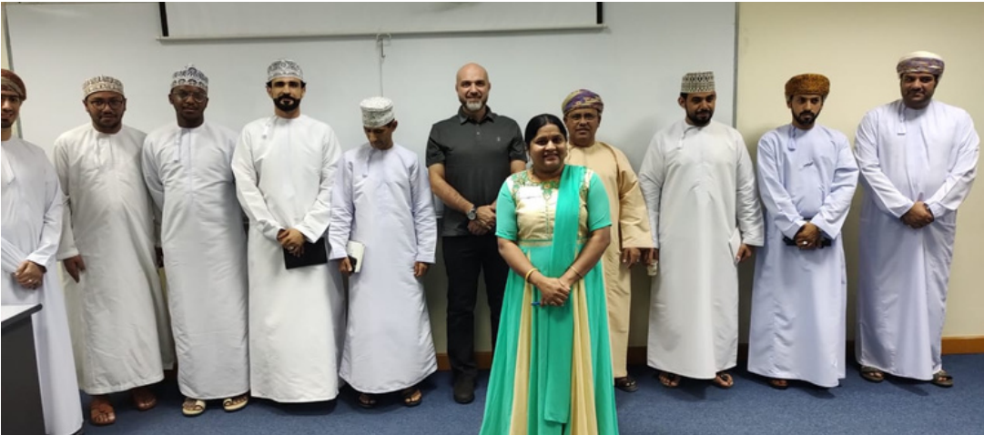
Club Officers Installation