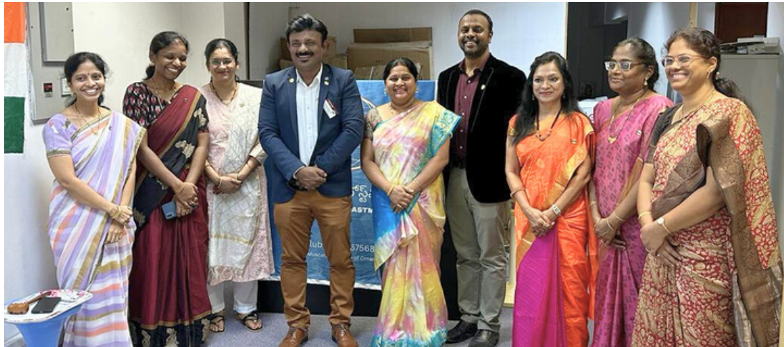
Club Officers Installation