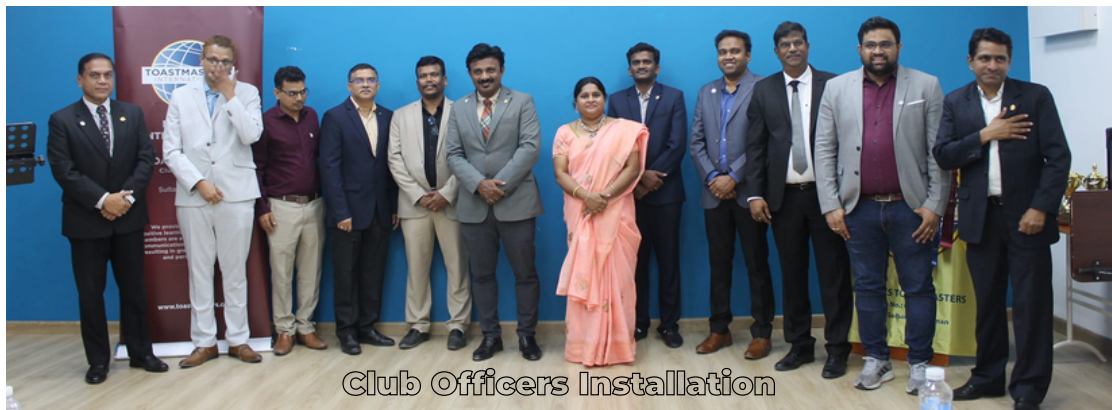
Club Officers Installation