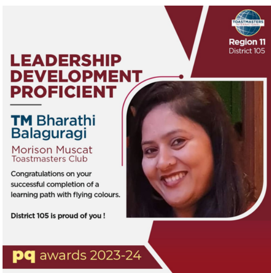
Awards & Recognition from District 105