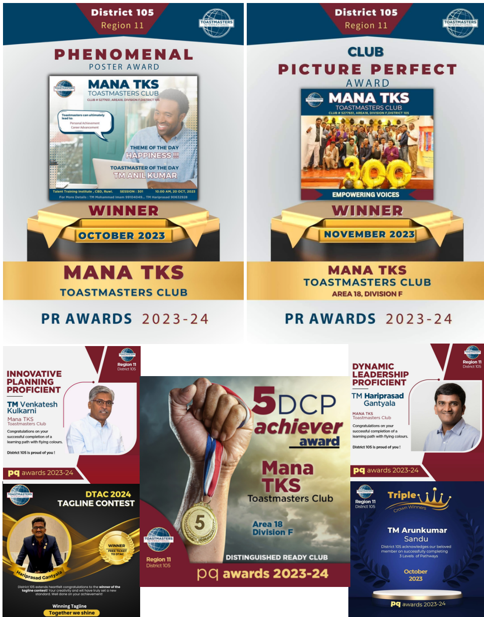
Awards & Recognition from District 105 team