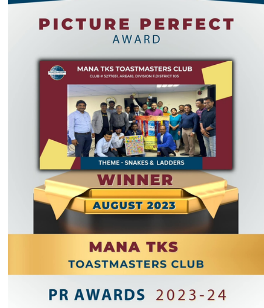
Awards & Recognition from District 105